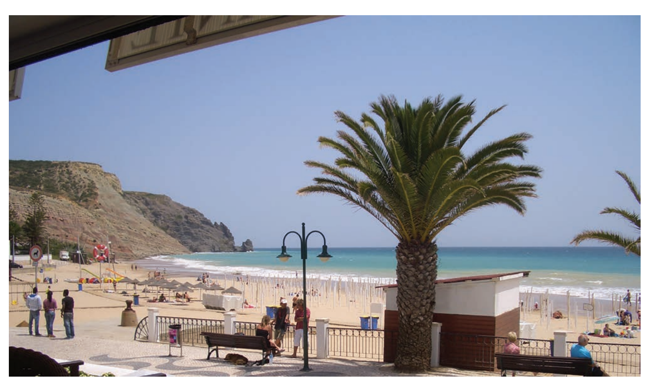
Fig. 2.2 for Question 2