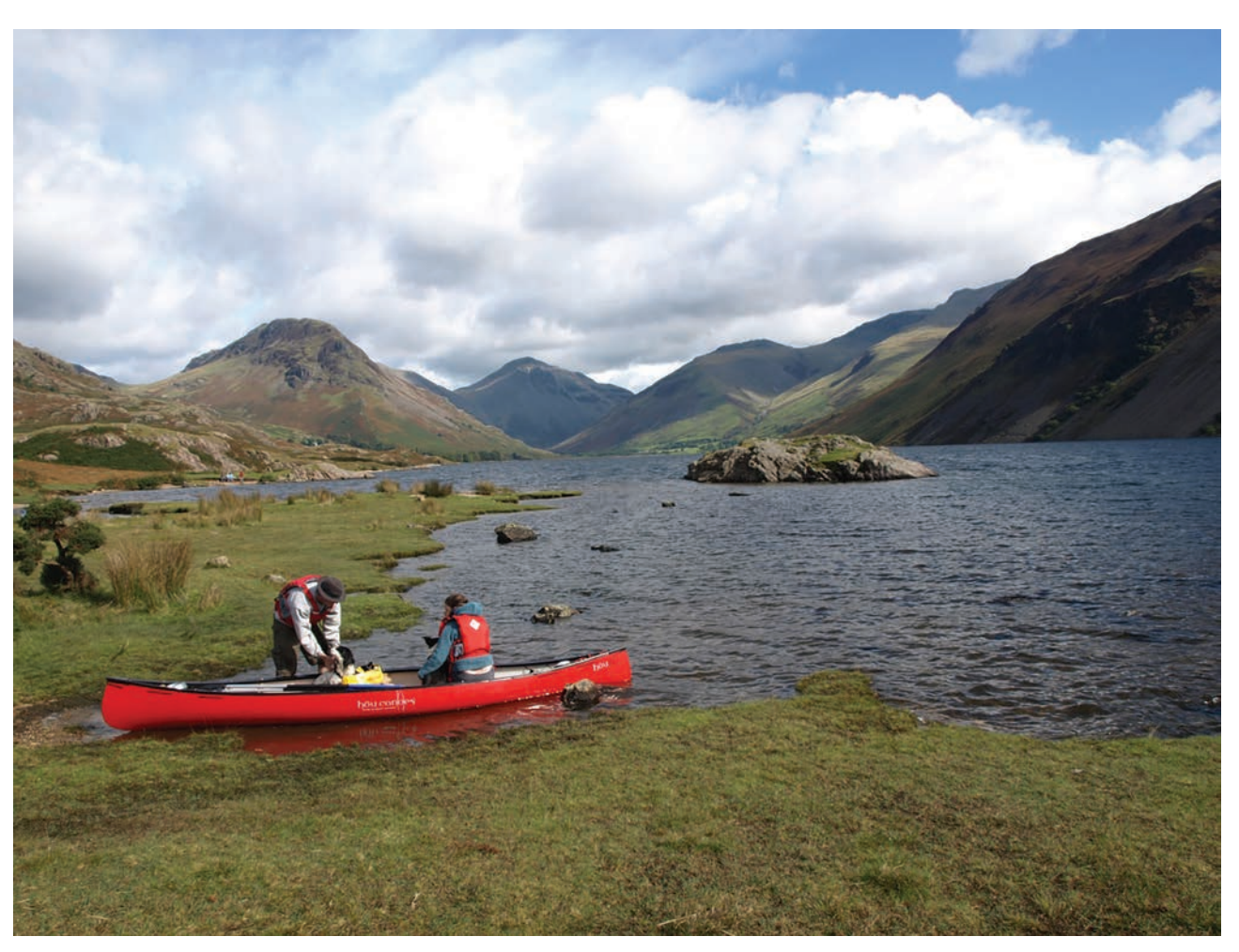
Fig. 6.2 for Question 6